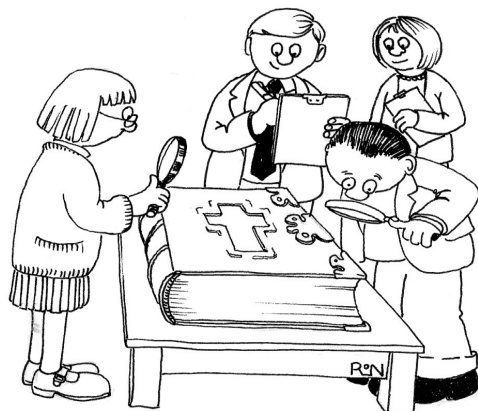
Every week they gathered for Bible Study

Prayer for October - please see P13 for the prayer by Bede September 200 club winner - Sue Gudgeon (Brunskill)